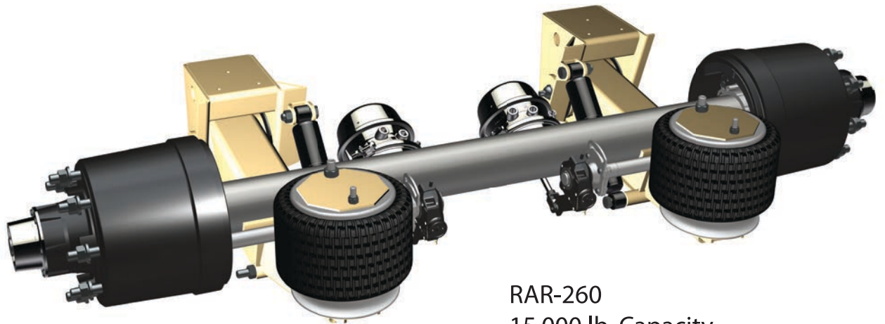
RAR-260 15,000 lb. Capacity

Heavy Duty Air Ride for 10K, 12K, and 15K Axles