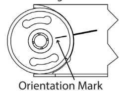
Figure 1. (Wide) Bushing Orientation Draw Reference Line on Beam Before Bushing is Removed