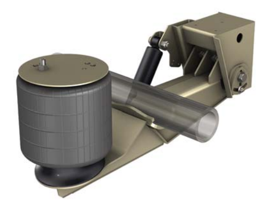
Available in 5½" ride height with 6" pivot height to minimize wheel hop with 17½" tires!

Patented contoured axle seat Shear-type pivot bolt